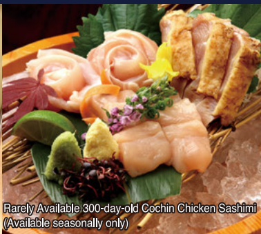
Rarely Available 300-day-old Cochin Chicken Sashimi (Available seasonally only)