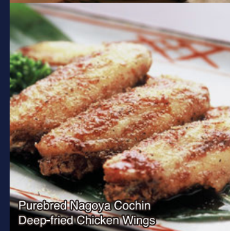
Purebred Nagoya Cochin Deep-fried Chicken Wings