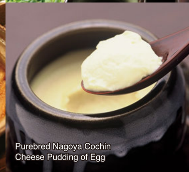
Purebred Nagoya Cochin Cheese Pudding of Egg