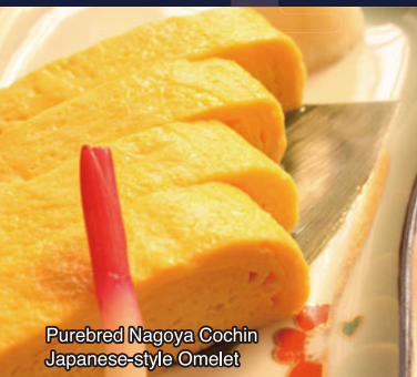
Purebred Nagoya Cochin Japanese-style Omelet

All these chicken are Nagoya Cochin Chicken.