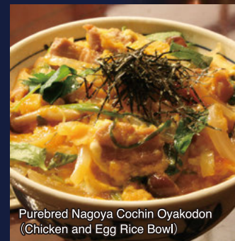
Purebred Nagoya Cochin Oyakodon (Chicken and Egg Rice Bowl)

For welcoming parties, farewell parties, and get-togethers of all kinds, we offer a variety of courses to fit your budget. We invite you to enjoy our specialty purebred Nagoya Cochin.