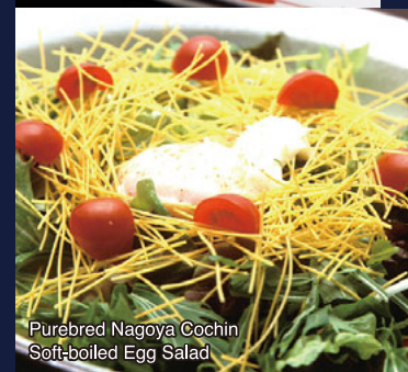
Purebred Nagoya Cochin Soft-boiled Egg Salad