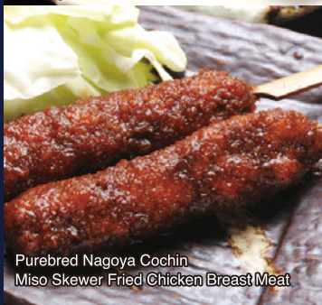
Purebred Nagoya Cochin Miso Skewer Fried Chicken Breast Meat