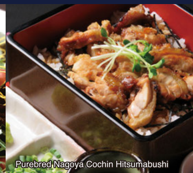
Purebred Nagoya Cochin Hitsumabushi

Preparation may vary depending on location.