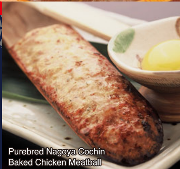
Purebred Nagoya Cochin Baked Chicken Meatball

Preparation may vary depending on location. The information provided here is current as of April 2019 and is subject to change.