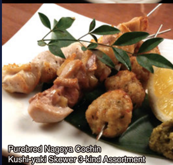
Purebred Nagoya Cochin Kushi-yaki Skewer 3-kind Assortment